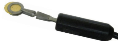
Handle Test Electrode w/ attached cable 52-5685-10 (for use w/ Test insulation Electrode)